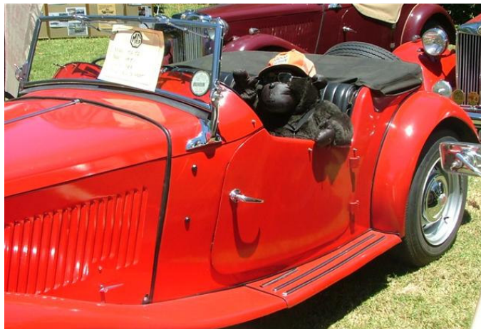
One of the funnier items seen at Timour Hall this year