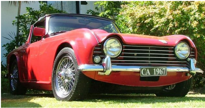
Neil's repaired TR5 at Timour Hall